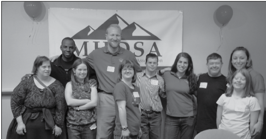
Members of the Glendale Raptors rugby team joined with MHDSA self-advocates for a fun night of card-making and socializing.