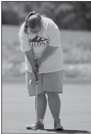
One of the 120 participants in the 2010 Tee Up tournaments gets ready to hit the ball.

For more information, please visit www.MHDSA.org/golf/ or call 303-797-1699.